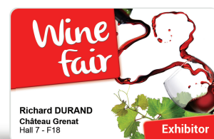
Invitations to your events